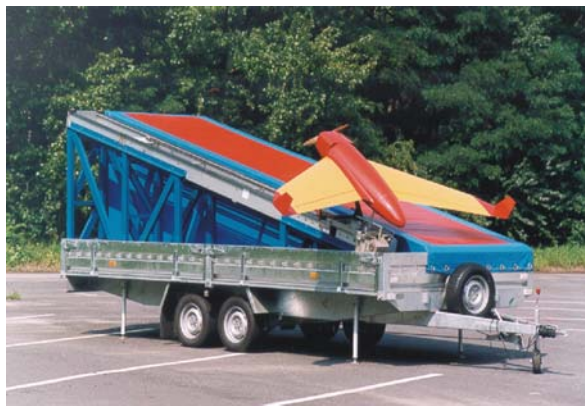
Figure 5: The CHRABAŚZCZ UAV

What resulted was an aerial target CHRABAŚZCZ (May-bug), designed for providing the troops with range training in the firing of portable launchers, anti-aircraft artillery and rifled weapons at aerial targets.