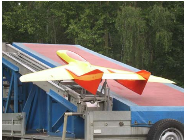
Figure 8: High speed jet powered aerial-target simulator Turbo KOMAR

In order to fill the existing gap AFIT's UAV Research and Development team designed and tested a new kind of vehicle – the jet engine powered Turbo KOMAR. Similar to previous designs it has been intended to start from the catapult - bungee or pneumatic (under development). The new system is intended to fly under fully autonomous control.