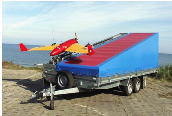
Figure 7: Recoverable aerial-target simulator SZERSZEŃ