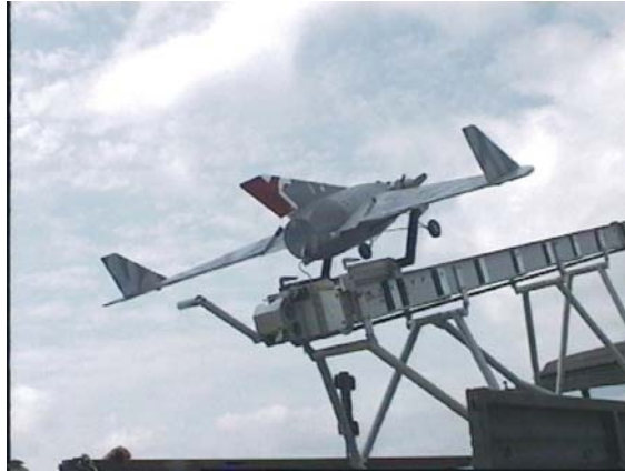
Figure 3: The Falcon UAV

integrated with the 35 MHz transmitter. Actual positions of the control sticks and switches were given in the form of readouts by a processor-controlled electronic system of the manipulator and translated into the pulse-code modulated (PCM) FM signal. The effective service range of the remote-control unit was, approximately, 1 km.