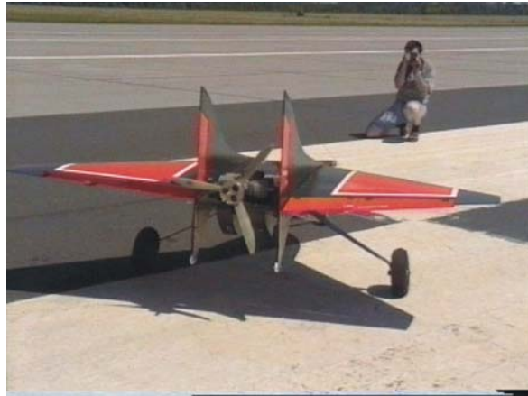
Figure 3: The WAMPIR UAV

A ground-located operator controlled the WAMPIR by means of a remote-control manipulator. The operator handled the manipulator equipped with control sticks and switches and integrated with the 35 MHz transmitter. The readings of current positions of the control sticks and switches were given by the manipulator's processor-controlled unit to be then converted into the pulse-code modulated (PCM) FM signal. The signal was received with the airborne receiver to be then converted to provide real-time control of servo-mechanisms which drive control surfaces and other control components. The battery that powered the target drone's controls was common to both the receiver and the servos. The remote-control system's effective service range was approx. 1 km.