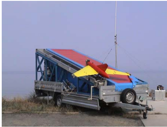
Figure 6: Single-use (non-recoverable) aerial-target simulator KOMAR