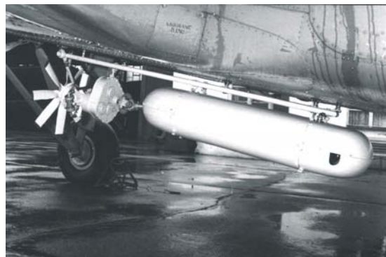
Figure 2: The RZ-1000 winch

At the same time, i.e. in the years 1976-78, designed and developed was the RZ-1000 winch (Fig. 2). It was an externally, i.e. under the An-2 fuselage, carried system to wind/unwind a 1000 m towing line with a sleeve target attached. The system was used for small-size weapons practice firing at low-flying targets. The winch was operated by a co-pilot, via a control desk on the left side of the aircraft cockpit.