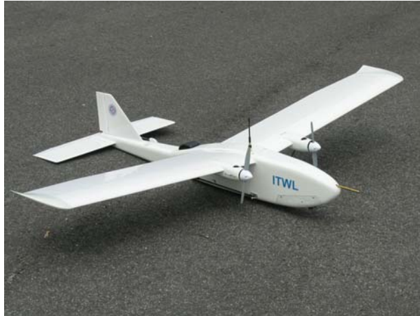
Figure 9: Hob-bit reconnaissance vehicle under development.

The vehicle is either hand, bungee or catapult launched. It can operate up to 1 hour. It's recovered by belly or parachute landing.